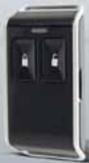
RADION Wireless handheld transmitter

The RADION range includes 15 different peripherals, which are connected to the AMAX intrusion alarm systems via a receiver.