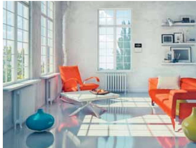
Application example: Single-family home

The flexible hybrid system for wired and RADION wireless detectors is the ideal solution for private applications, such as single family homes, where wiring is either undesirable or not possible.