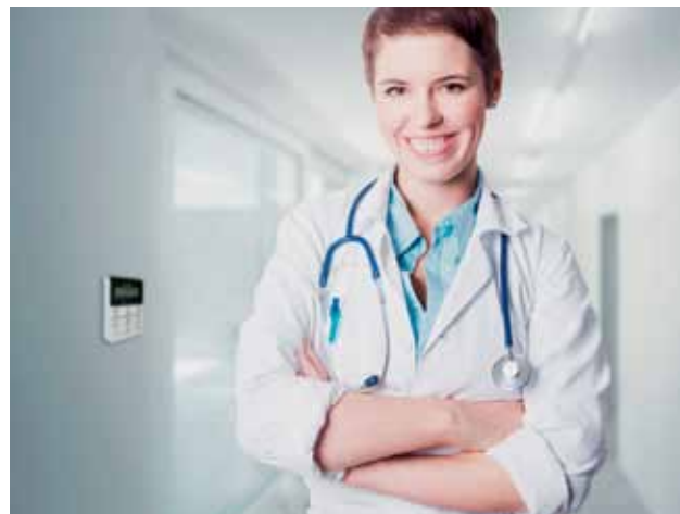
Application example: Medical center with several individual practices in the building

The all-round control panel, which features up to 64 zones, is ideal for medium-sized applications. This means, for example, that they can be used as a shared intrusion alarm system for a medical building with individual practices. Each practice receives its own peripheral elements and keypads for individual control. The AMAX 4000 can be combined with both wired and RADION wireless detectors as a hybrid control panel.