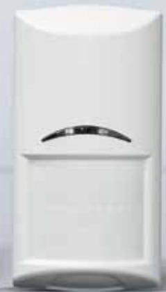
RADION Wireless motion detector