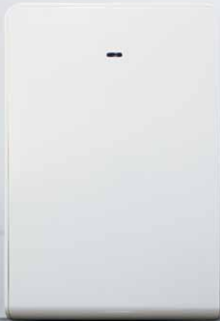
RADION Wireless receiver