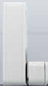
RADION Wireless door/window magnetic contact