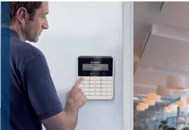
Easy to use