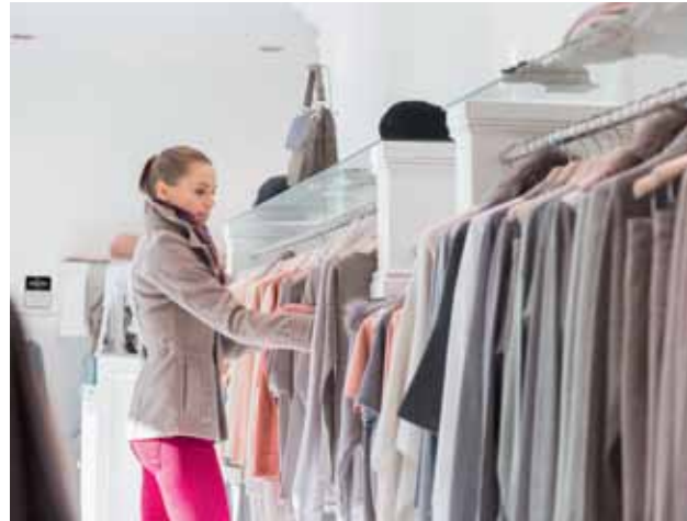
Application example: Specialized retail trade business with sales and storage area security

Various wired peripheral elements, such as motion detectors for indoor and outdoor areas or magnetic contacts for doors and windows, can be connected to the 8 zone inputs.