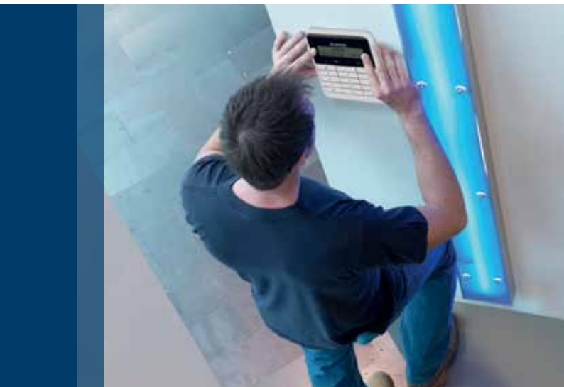
Easy to install

Your customers can combine the AMAX system with a video surveillance system by integrating Bosch IP cameras. It is also possible to display video images on smartphones and tablet PCs. This means that your customers can check alarm notifications quickly, reliably and at any time using live images. AMAX intrusion alarm systems can also be used for fire detection using either wired smoke detectors or RADION wireless smoke detectors.